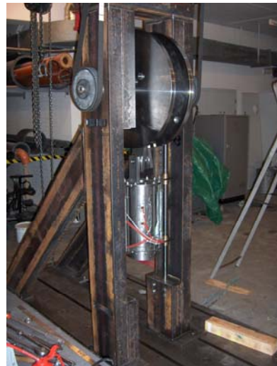
Friction Test Rig