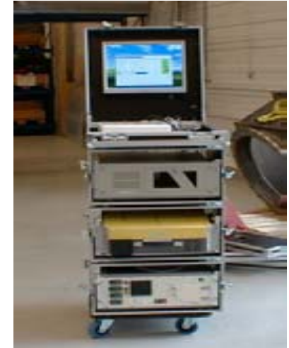
Test set-up for on-board measurements